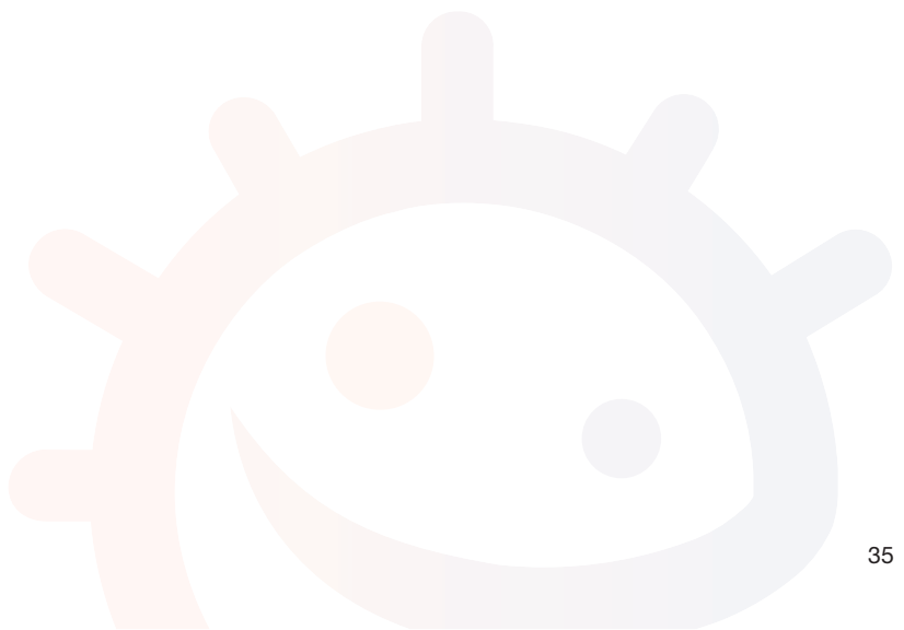
SW1 Useful Microbes and Their Properties Worksheet