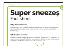
SH1 Super Sneezes Fact Sheet