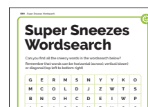
SW1 Super Sneezes Wordsearch