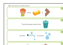
SW2 Super Sneezes Fill in the Blank Worksheet