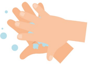
Scrub your hands