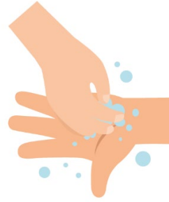
Tips of fingers