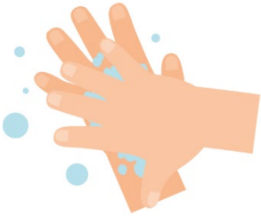
Backs of hands