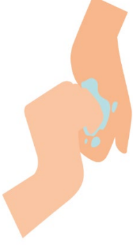
Back of fingers